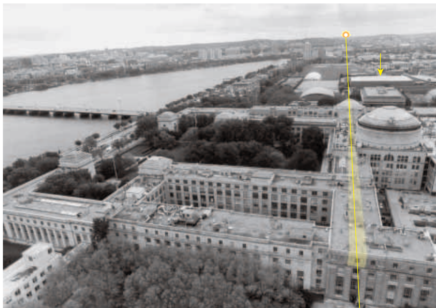
MIT’s celebrated Infinite Corridor (highlighted) runs through five buildings, collectively known as MIT’s main building. The view here looks to the west-southwest, where the Sun can shine completely down the hall. The Zesiger Sports and Fitness Center that opened in 2002 (arrowed) lies just clear of the alignment.

Johnson, who retired from MIT in 1994 and now runs his own design business in Newton, Massachusetts, still remembers the scene as people were at the dark stairwell, with their eyes down near